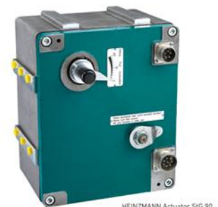
Heinzmann StG90 Actuator