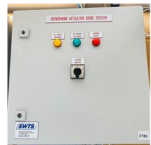
Customised Control Panel