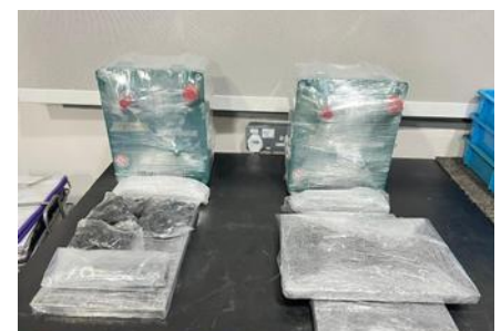
Customised Brackets and Plates with Actuators Ready for Delivery

Price of Product and Service – Upon Request