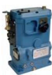
2221 Hydraulic Actuator