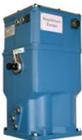
1500 Type Governor