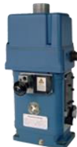
1115 E.Hydraulic Governor