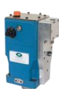
2800 Hydraulic Actuator