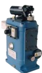
1102 Type Governor