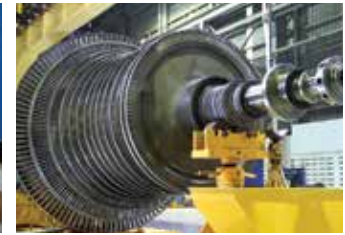
Steam Turbine Overhaul