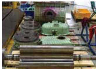
Dismantling in Progress