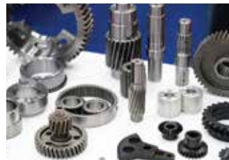
Precision Parts Fabrication