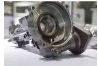
Casting of Various Components