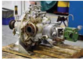
General Purpose Steam Turbine