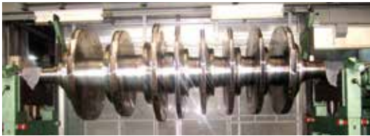
Balancing of Scroll Rotor