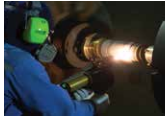
HVOP/ Metal Spray Build-up Process