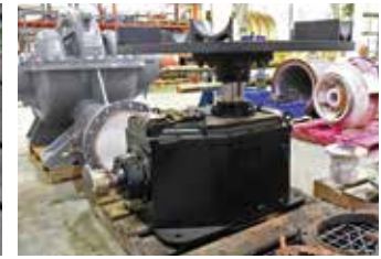
Cooling Tower Gearbox