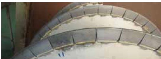
Refilling Scroll Flight