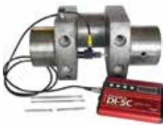
Crankshaft Web Deflection Kit