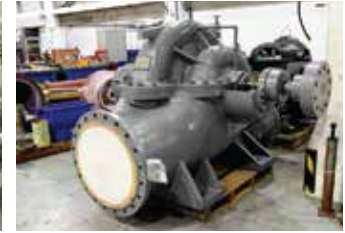
API 610 BB1