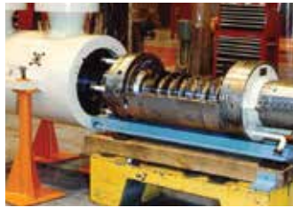
Compressor Bundle Overhaul