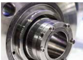
Seal and Bearing Replacement