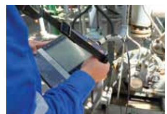
Vibration Monitoring and Field Balancing