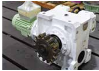
Variable Speed Gearbox