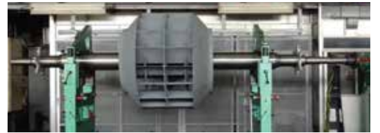
Dynamic Balancing after Fabricate New Shaft