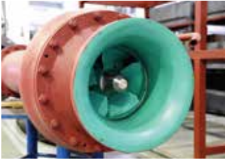
Sump Pump (Vertical)