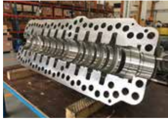
API 610 BB3 (Multistage Horizontal)