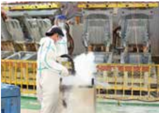
Dry Ice Blasting/ UHP Jetting