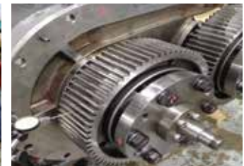
Timing Gear Backlash Setting