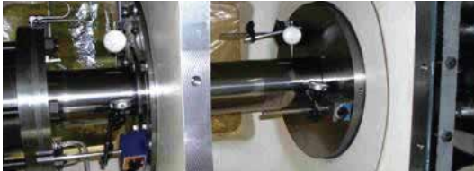
Piston Rod Run-out Check