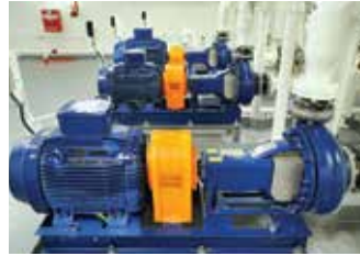
API 610 OH1 (Overhung)