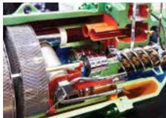
Semi-Hermetic Compact Screw Compressor