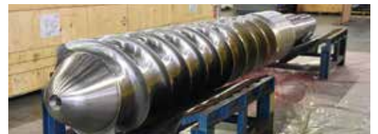
Screw Rotor Element